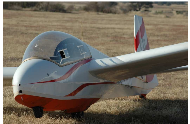
.....D13 seen waiting for a Badge flight!!